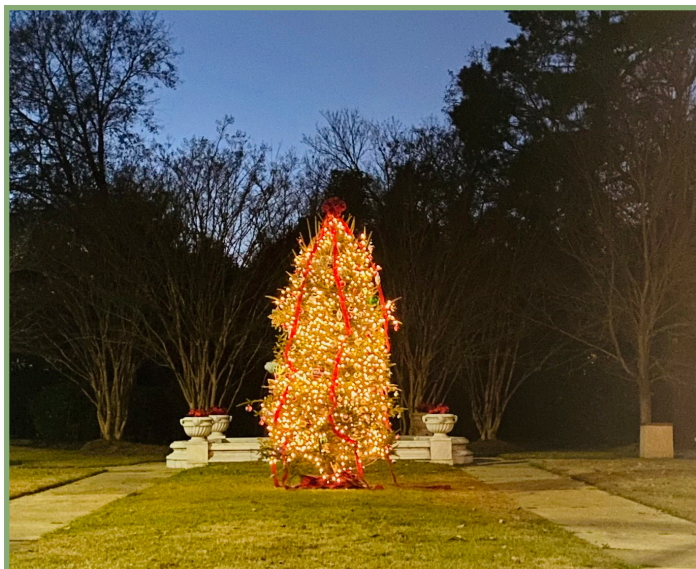
We love MidTown at Christmas! Pictured here is the Sarling Fountain decorated for the season, bringing Christmas cheer to all.