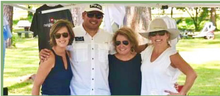
2021 MidTown, Inc. Staff