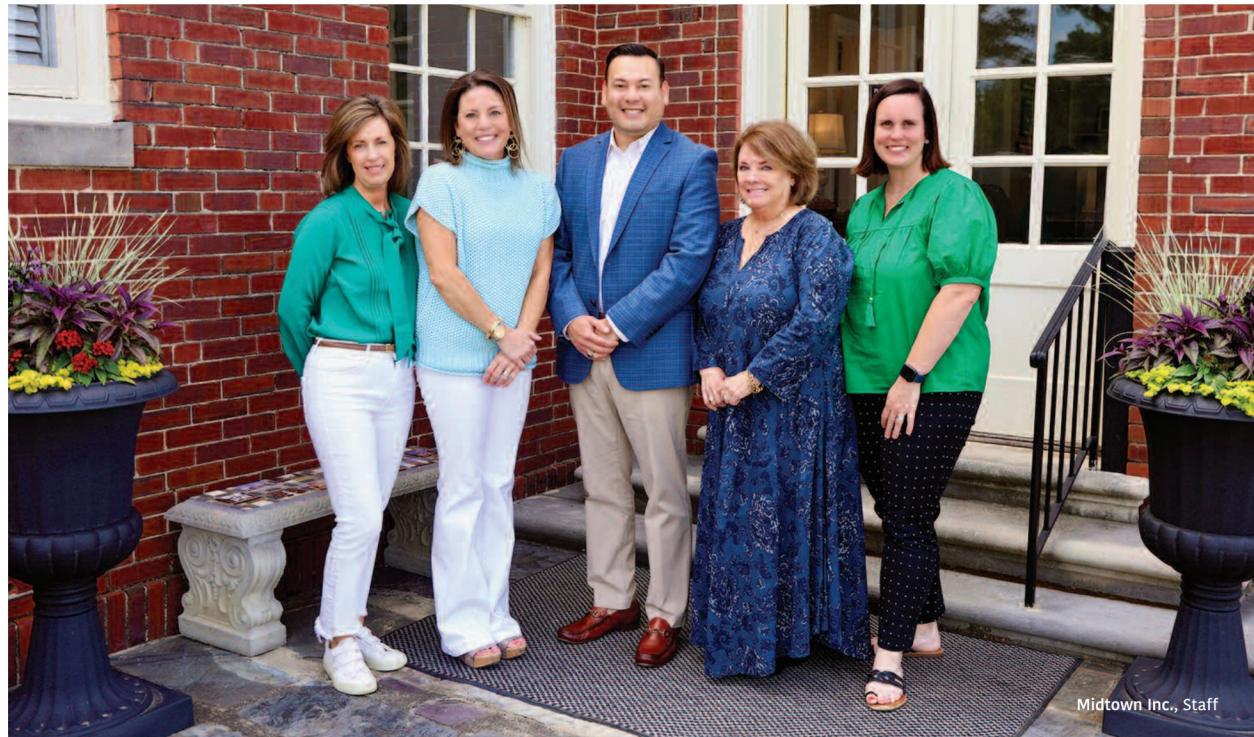
Midtown Inc., Staff