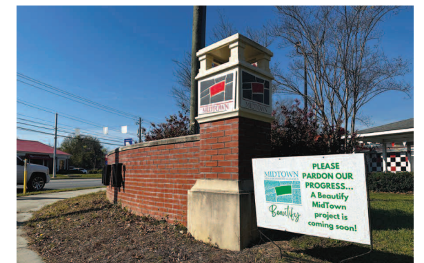
In 2025 MidTown began beautification efforts to enhance one of its gateways at the intersection of Wynnton Road and Hilton Avenue.

Through the MidTown Business Association, we promoted local businesses, hosted mixers, and welcomed new members into a network built on visibility, collaboration, and hometown pride. We also worked with city leaders and community stakeholders to support improvements that make MidTown easier to navigate and better to enjoy, from walkable corridors to public spaces and private businesses. Each opening, upgrade, and partnership is one more step toward our 20th anniversary, and the bigger projects now coming into view.